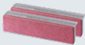
Type F (Fibre) For work pieces with finely milled, ground or polished surfaces.