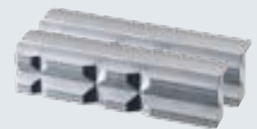
Type P (Prisms) For work pieces in the most diverse shapes.

Ready in an instant: the compact suitcase set offers maximal mobility and functionality.