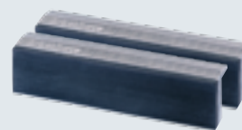
Type G (Rubber) For thin walled pipes and pre-cut blanks as well as wood and plastic pieces.