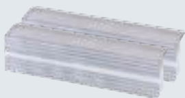
Type N (Neutral) For coarse to medium fine worked work pieces.

Included in the set: HEUER magnetic protective jaws. The right span for any workpiece: